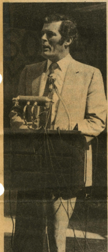
Education Minister William Vander Zalm who officiated at the dedication of the new multi-purpose building at Capilano College on Tuesday, April 12.