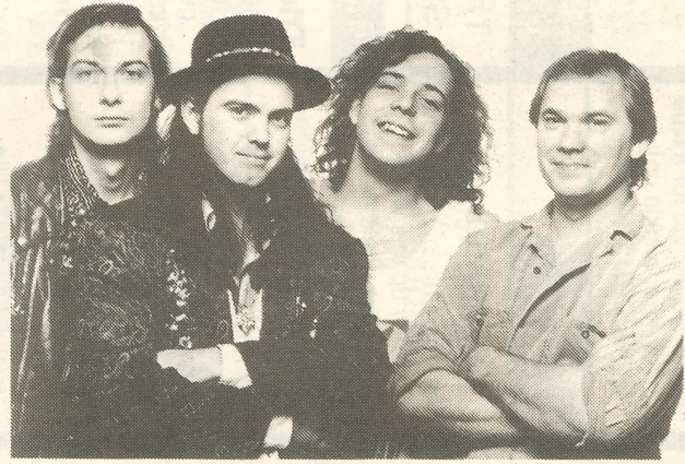
Jr. Gone Wild, Jan. 22nd at the Black Lounge (U of C)