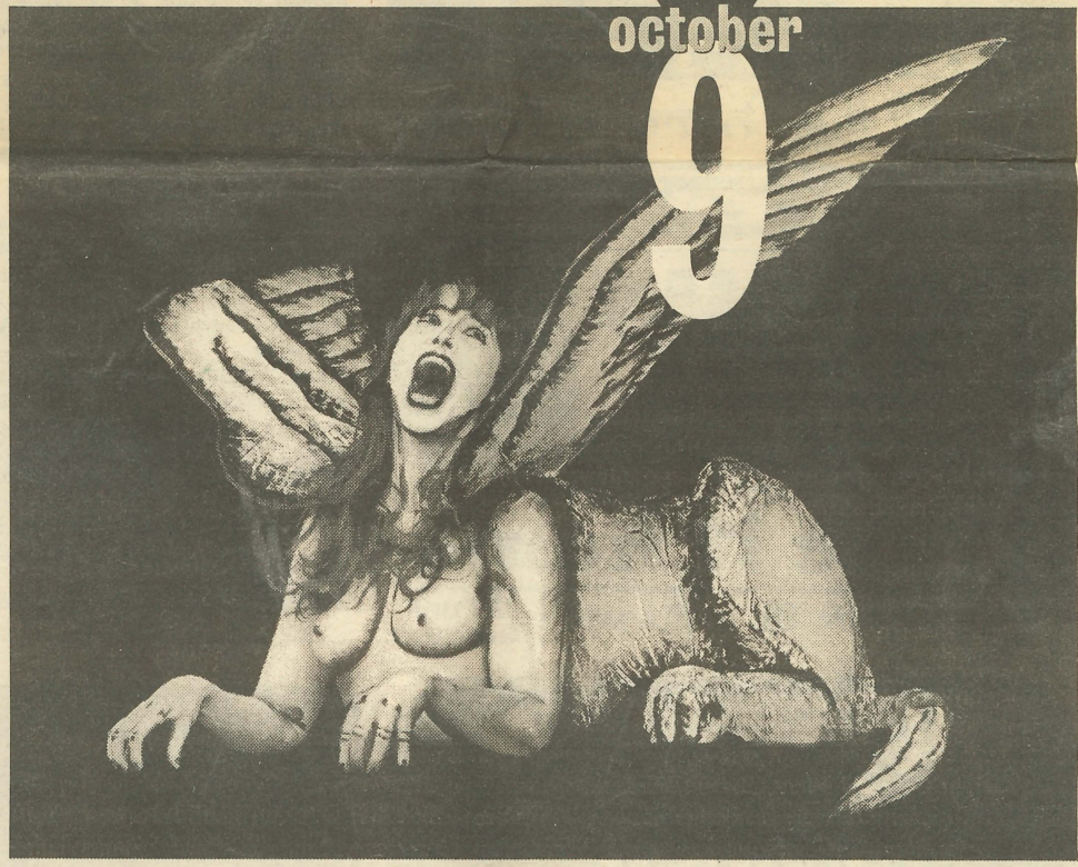
A retrospective of Suddenly Dance. See Dance