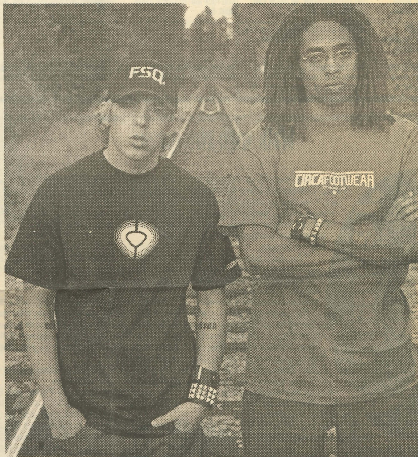
Local heroes Swollen Members set to shutdown Memorial Arena Thursday. See Music

Day of Defiance A rally and march for community solidarity against cuts and privatization,