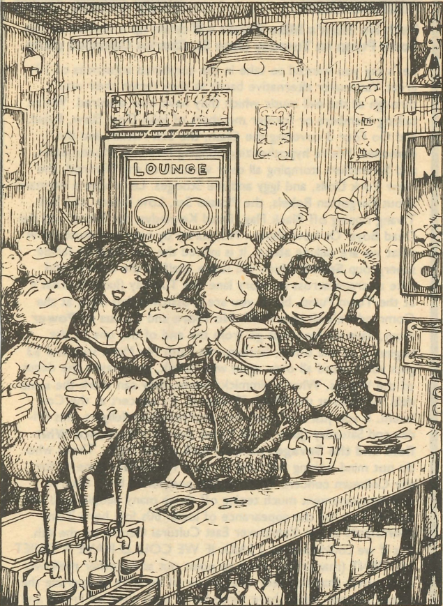
Life as an Elvis smell-allike.