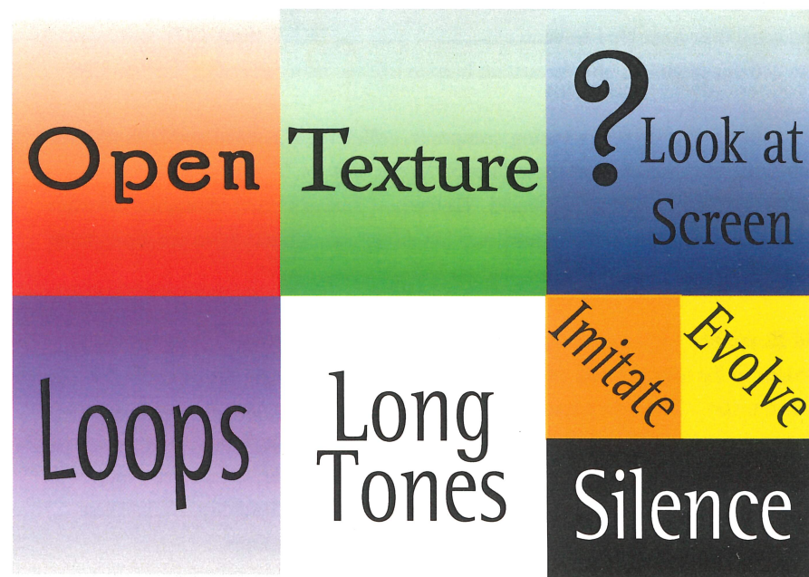
Mad Scientist Machine Score

Scales suggests that participants move around the fishes scales playing A or Ab and variations in the notes that are 1/8 or 1/4 pitch